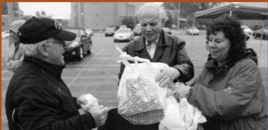
Volunteers assisting our members.