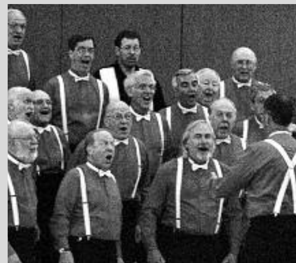
Heart of Maryland Chorus entertains joint dinner meeting guests of Chizuk Amuno's Club Hatikvah and Beth El's Seniors.