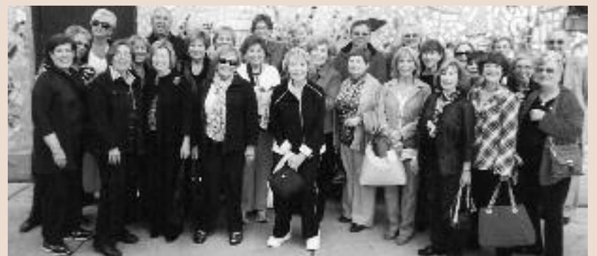
Beth El Sisterhood outside the Magic Gardens in Philadelphia, Pennsylvania.