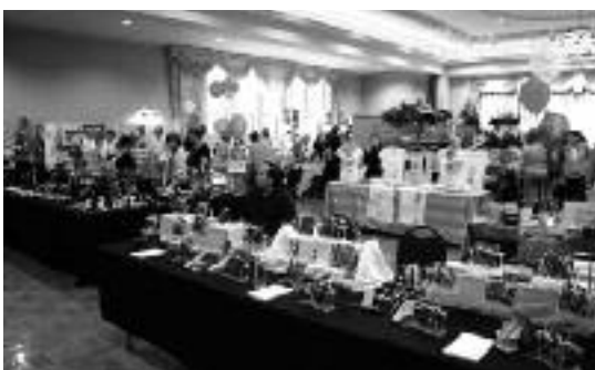
Something for everyone at 2012 Unique Boutique!