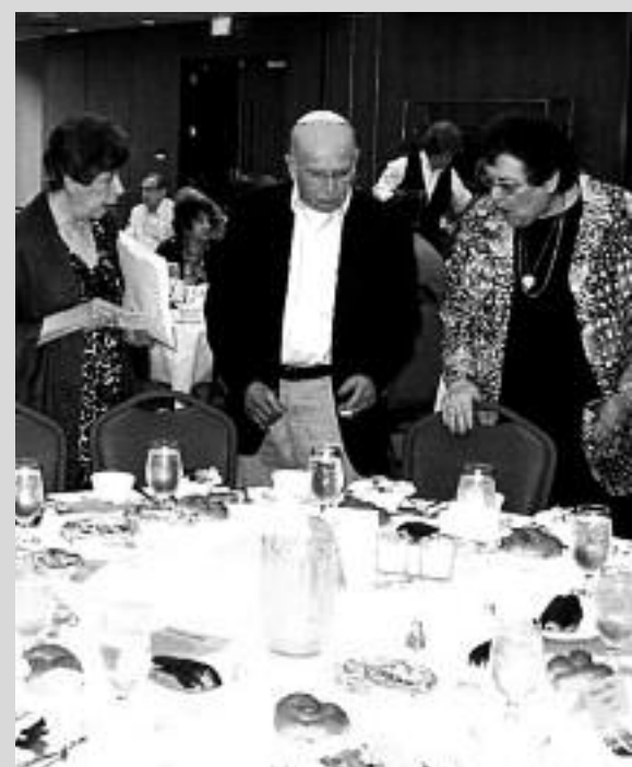
Beth El Seniors prepare for dinner at Chizuk Amuno's Club Hatikvah joint meeting.