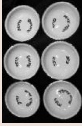
We can help you put together a beautiful Seder table with our holiday pieces.

Or by appointment, call Barbara Green 410-486-4080