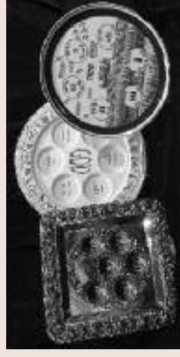
We have an extensive selection of Seder plates - traditional to contemporary.