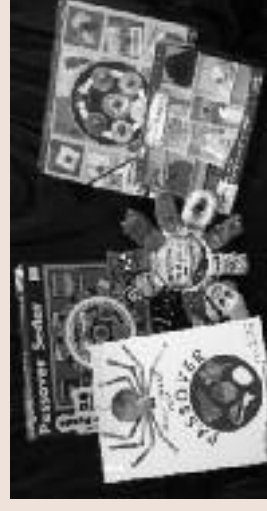
Keep you young guests engaged with our fabulous children's items.