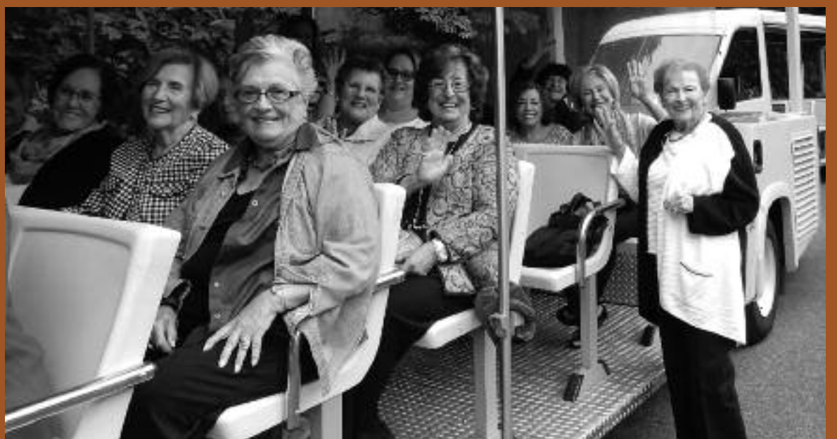
Sisterhood takes a garden tour at the Winterthur Museum. See page 5 for more on upcoming Sisterhood Trips.