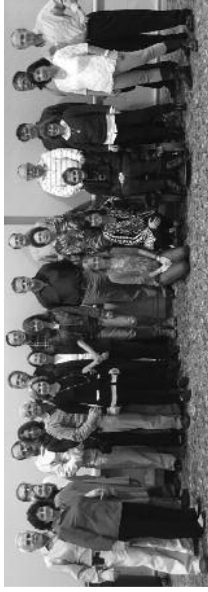
The Empty Nesters group gathered for an enjoyable dinner in the Offit instead of the sukkah. Despite the weather, a great time was had by all.

Remember the purchases you make help support the synagogue, Israel and Beth El Schools!