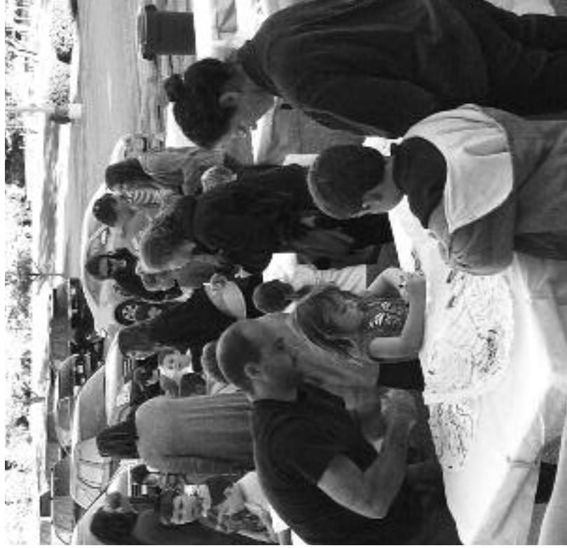
Children and their families work on an arts and crafts project before enjoying a meal in the sukkah.

Dated Material: Please Deliver by November 1